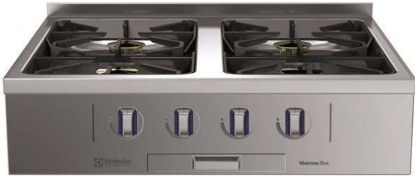
593106 4-Burner gas Top, ecoflam, one-side (MBGGBBHOVI) operated with backsplash, town gas